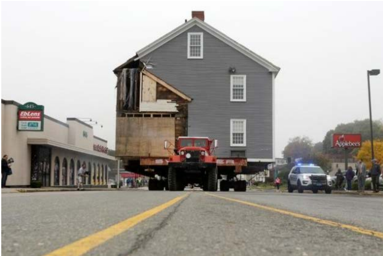
Stearns Tavern being relocated from 651 Park Avenue (October, 2016)