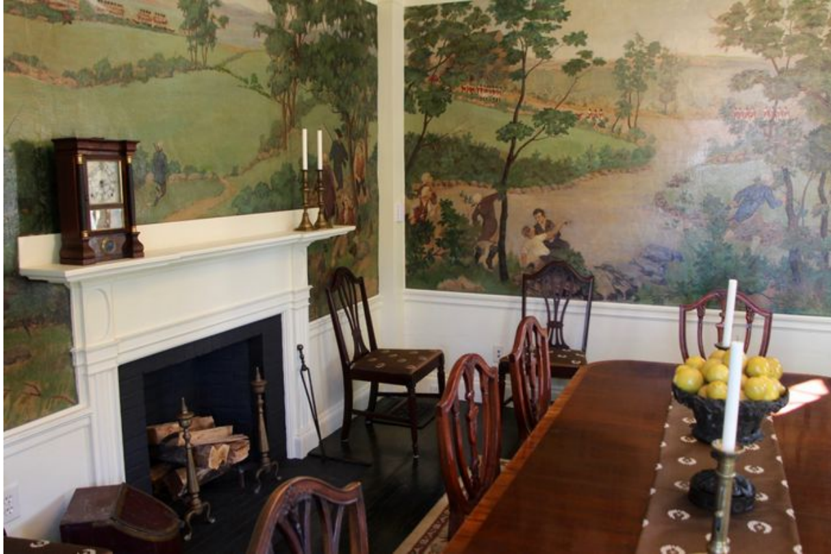
Community room within the Tavern.