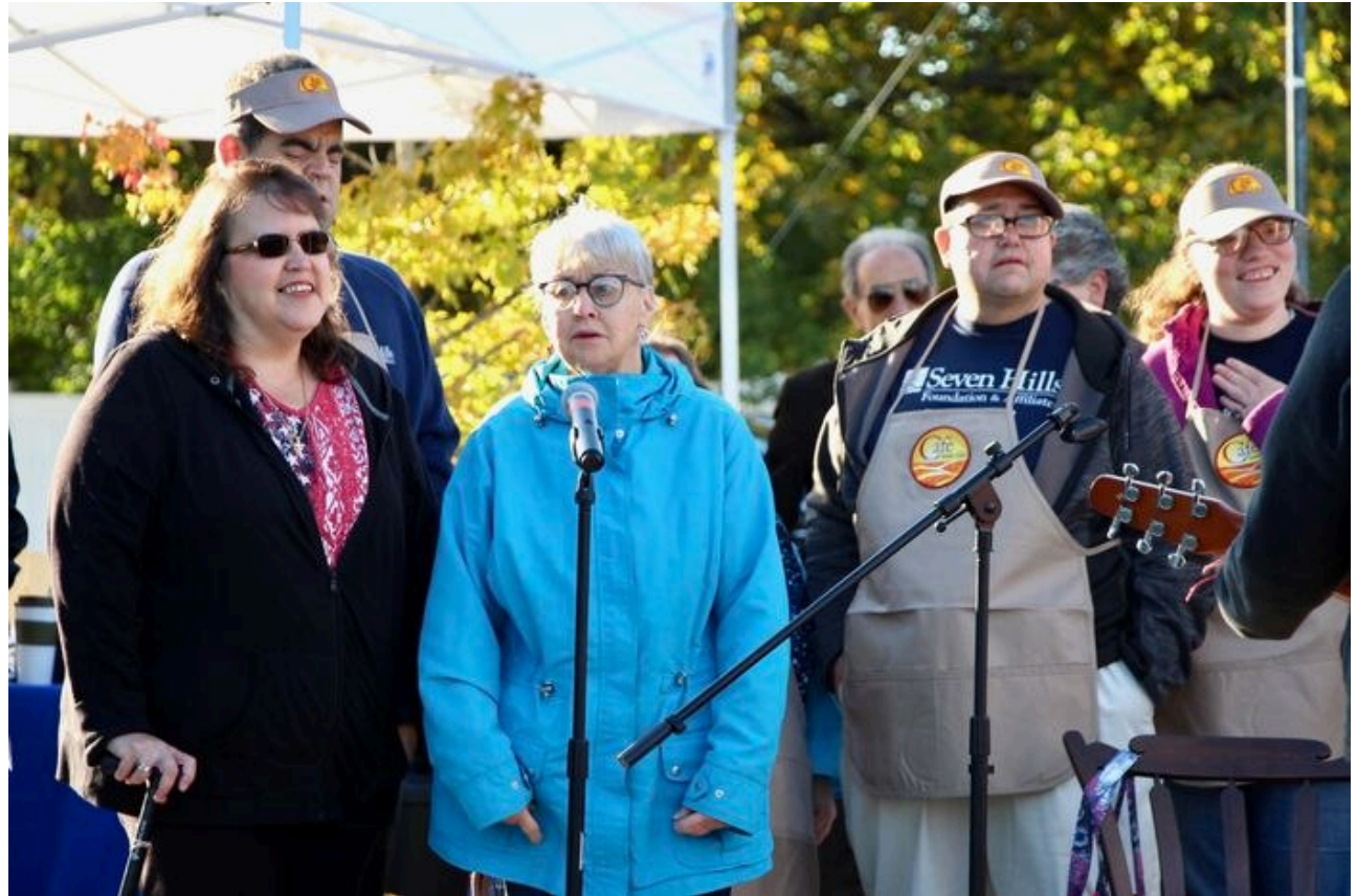
Seven Hills café employees celebrating the ribbon cutting in October, 2019.