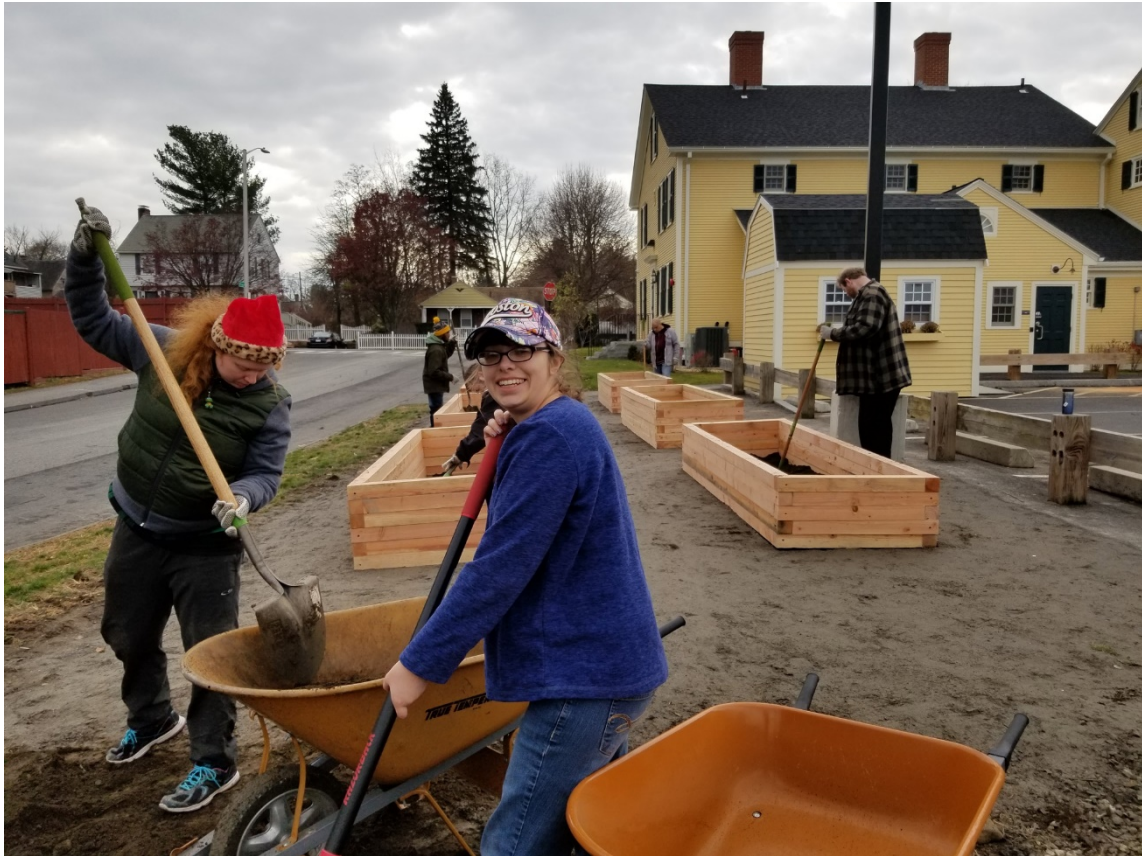
ASPiRE! Program participants installing garden beds in the exterior of Stearns Tavern.