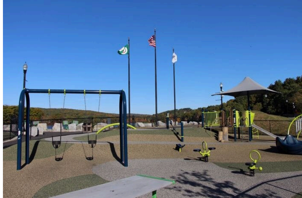
Multigenerational Playground and park that will provide recreational opportunities for persons of all abilities and ages.