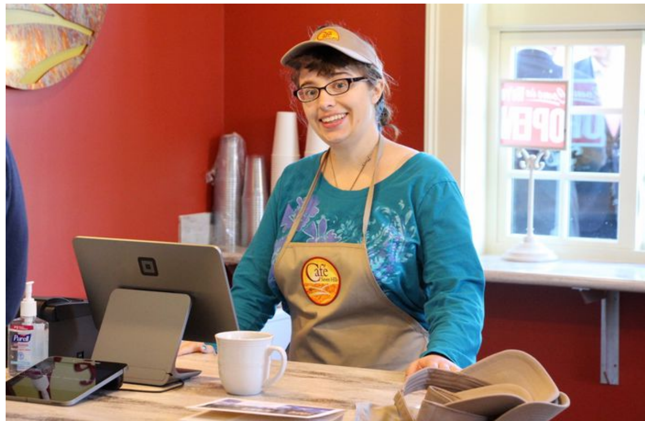
Employee at Seven Hill's Café on the opening day of Stearns Tavern.